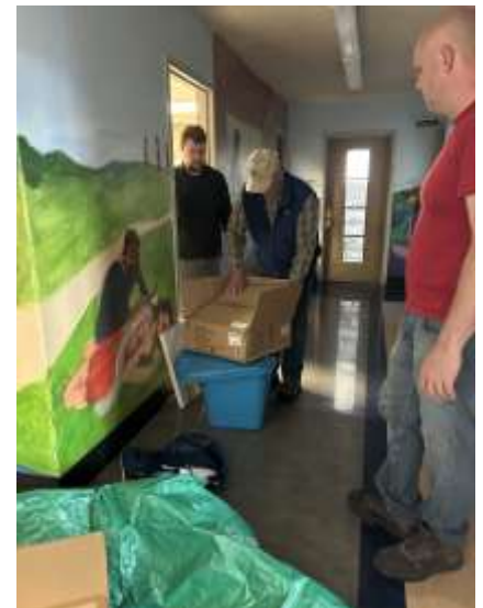
Cleaned and organized several storage spaces in the building