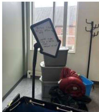
Staging for items to be stored until the Rummage Rampage