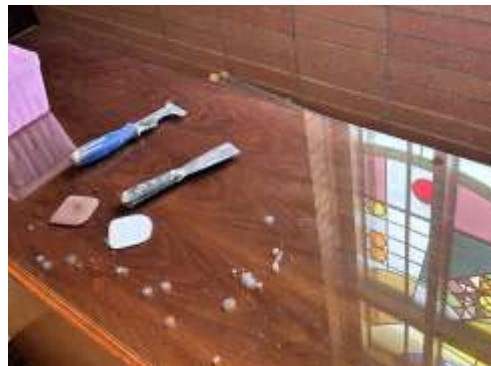
Cleaned wax off the altar in Nichols Chapel