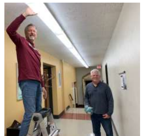
Cleaned bugs from the light fixtures