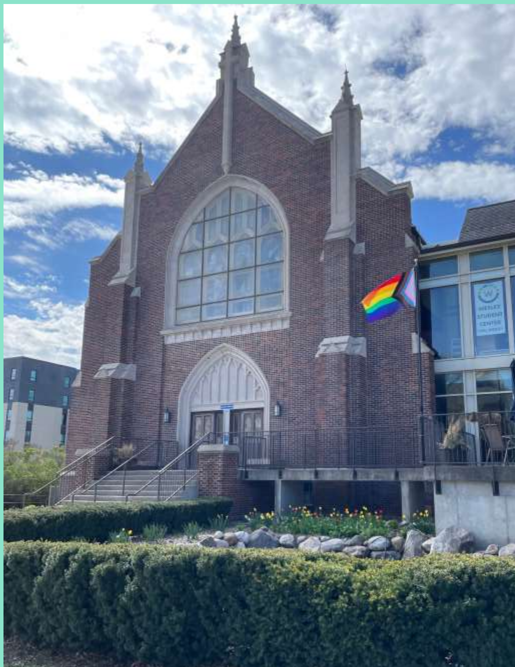
Collegiate United Methodist Church and Wesley Foundation Ames, Iowa