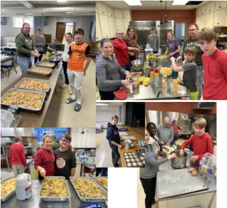
Easter Breakfast Prep