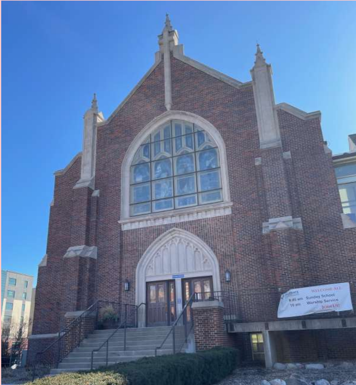
Collegiate United Methodist Church and Wesley Foundation Ames, Iowa