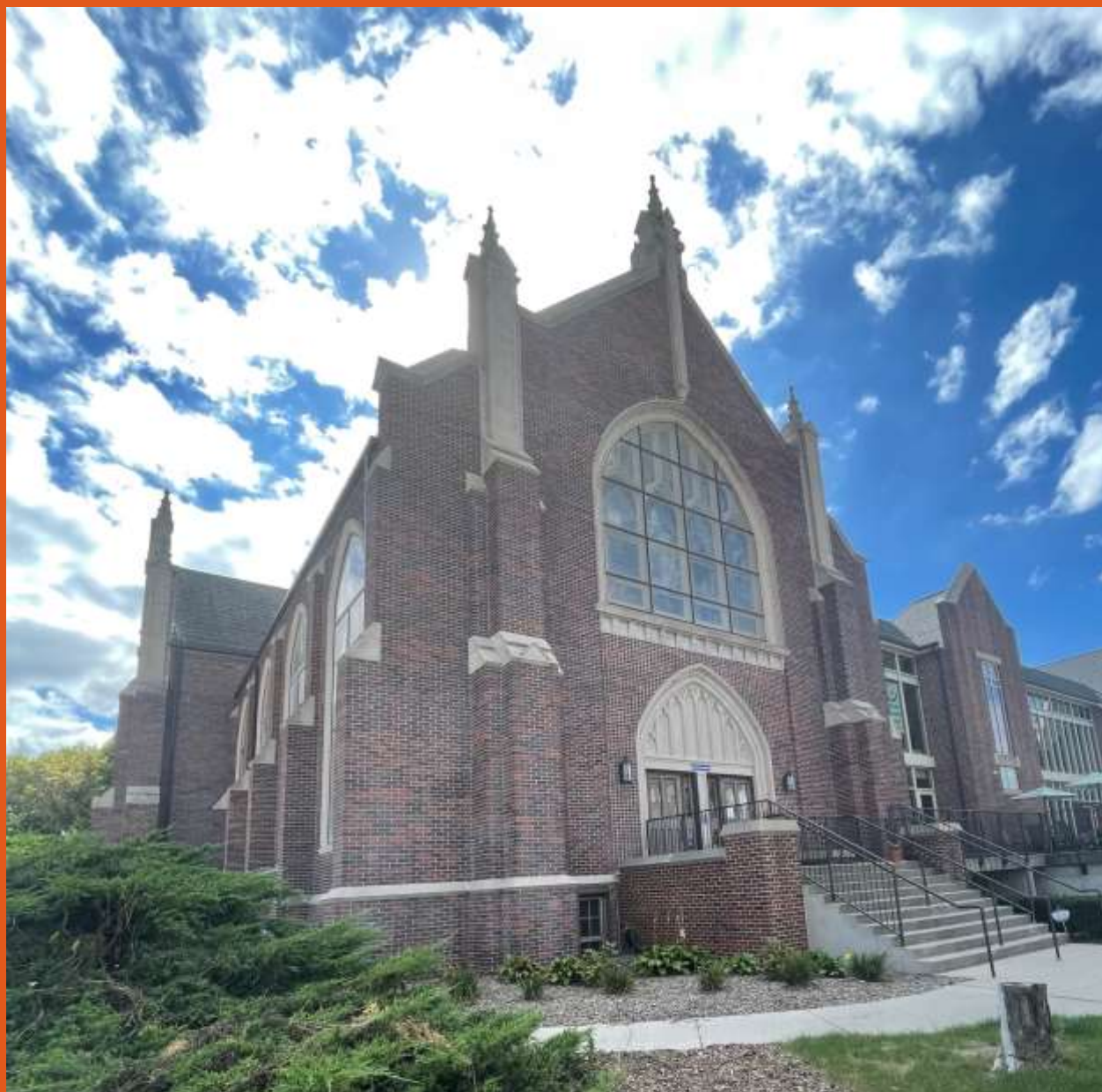
Collegiate United Methodist Church and Wesley Foundation Ames, Iowa