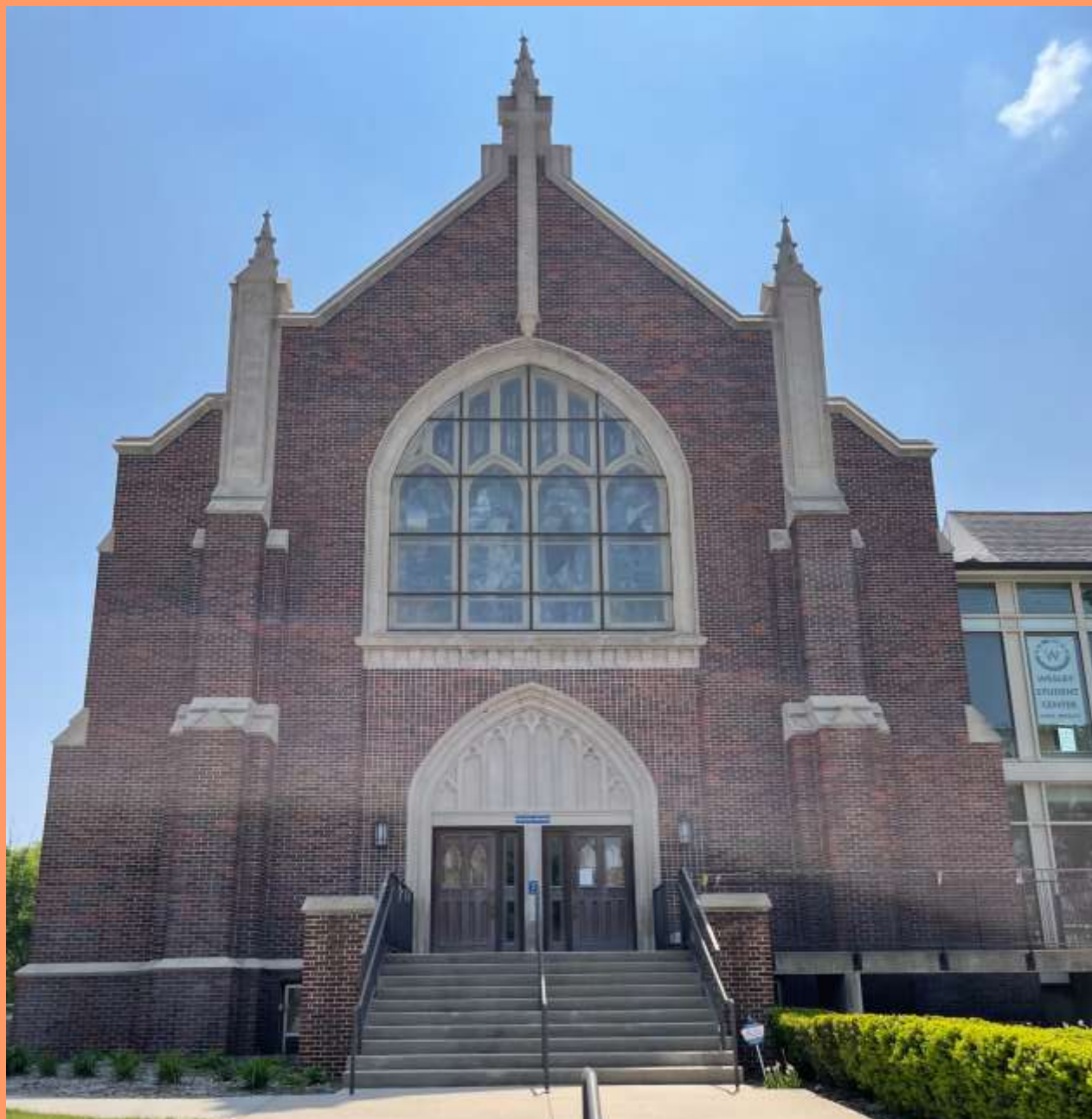
Collegiate United Methodist Church and Wesley Foundation Ames, Iowa