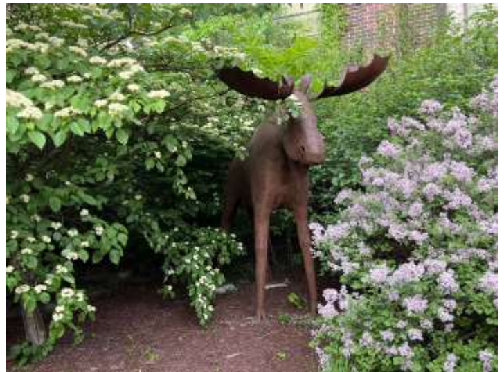
Right: Our moose, enjoying the spring blooms.