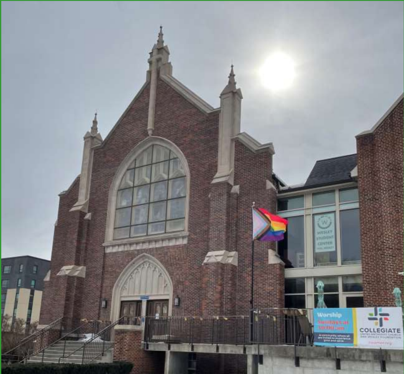
Collegiate United Methodist Church and Wesley Foundation Ames, Iowa