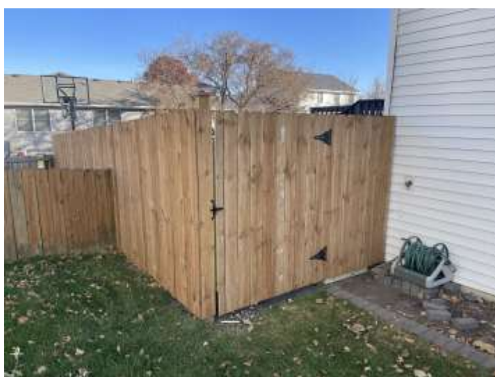
New fence at the parsonage on Keats St.