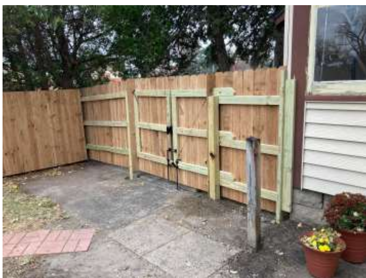
↑ Rebuilt fence at Wesley Place for Adventures Preschool ↓