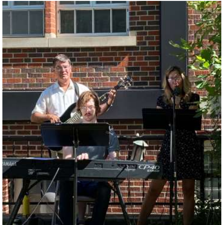
Pictures from Senior Sunday, Welcome Team Training, Funday School, Free Vaccine Clinic, Worship, and Confirmation Camp