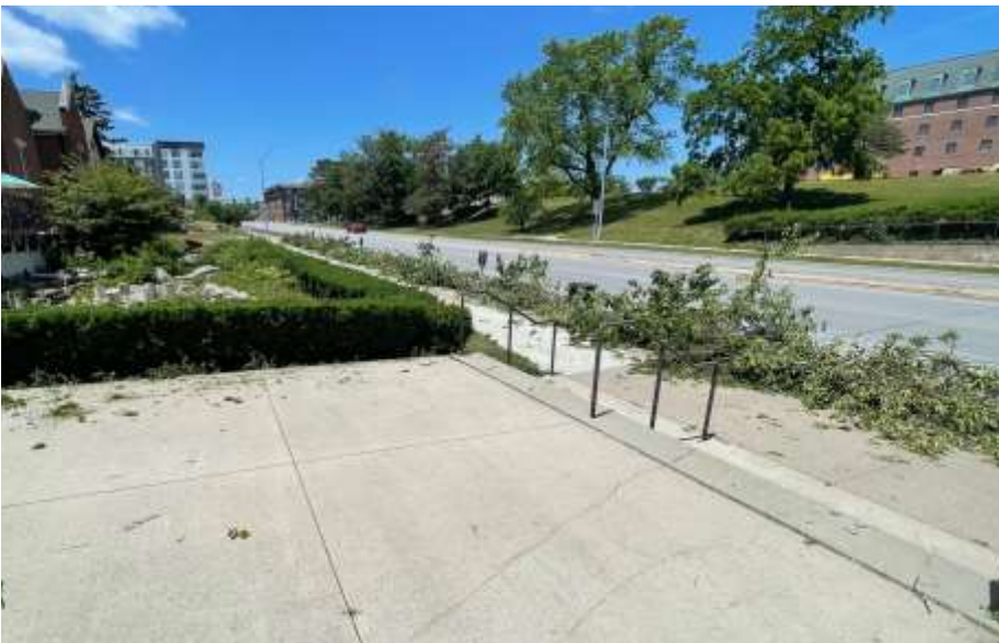
Note the amount of debris on the curb, waiting for pickup

I've really enjoyed keeping you all updated the last few months, but I'm even more excited for you all to see it in person!