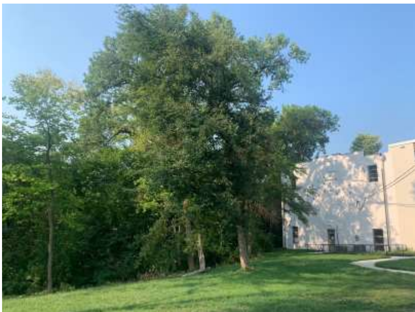
Shall we gather in the meadow?

resuming a full menu of learning and conversational groups. In addition, we will offer Morning Watch on September 6th and 20th and October 4th and 18th at 8:15am. These will be socially distanced in-person gatherings in The Meadow, the stretch of lawn east of the Annex and behind the utility building in the parking lot. These services will be simple, something like you might have experienced at camp and will last no more than 30 minutes. On the first Sundays of the month we will offer communion that is prepackaged in individual servings. We request that you wear a mask except when taking the communion elements.