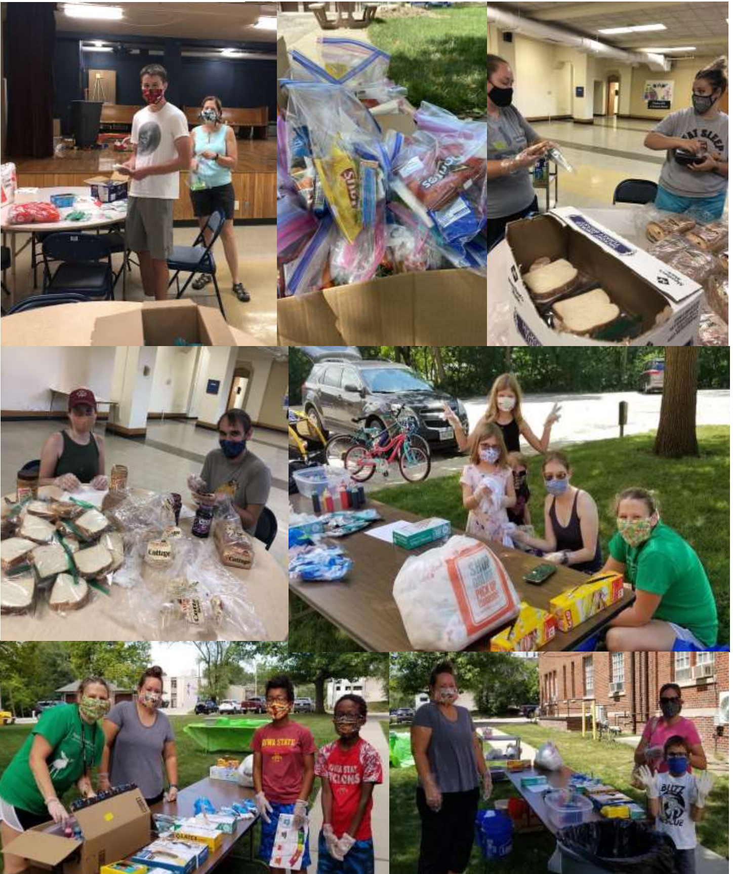
Top row and center left photo: Preparing and distributing 200 meals during the Drive-By Lunch on August 16.