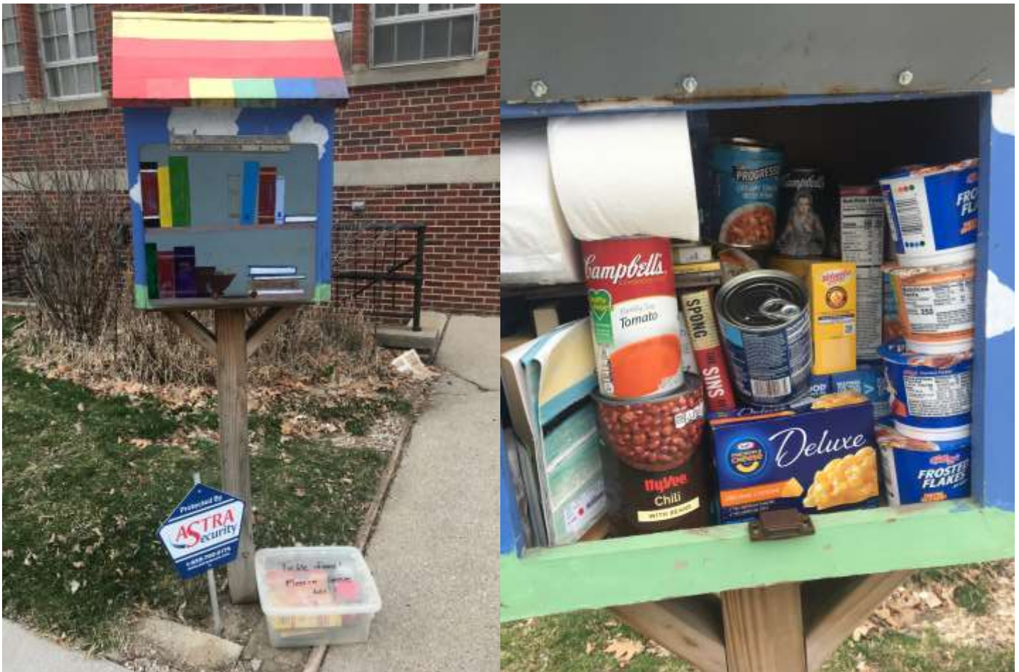
Our Little Free Library is currently doubling as a Little Free Food Pantry. Thank you to all who are helping with this.